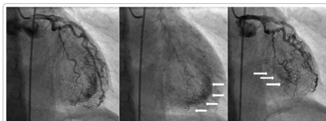
Figure 1: Left coronary circulation in the right anterior oblique cranial view. Opacification of apical segment with microfistular mesh (indicated with white arrow) observed in the left and middle pictures. Midventricular systolic opacification (indicated with white arrow) was observed in the right picture.

A 68 year-old female patient was presented with a class 3 anginal symptoms. On medical background, she was hypertensive and undermedication for dyslipidemia. Electrocardiography showed left ventricular hypertrophy criteria. Echocardiography revealed normal ejection fraction and left ventricular hypertrophy (1,3 cm) with apical predominance (1.5 cm). Three-vessel disease was obtained in the coronary angiography, and also, an unique diffuse microfistulas between left coronary system and left ventricle was observed. The fistulas was originating from small branches of left anterior descending and circumflex arteries and they was connected to rich microvascular mesh over apical segment with diffuse drainage system. In the each injection of left coronary ostium, apical segment was opacified in the wash-out period of coronary circulation and left ventricular cavity was visualized similar to standard left ventriculography view (Figure