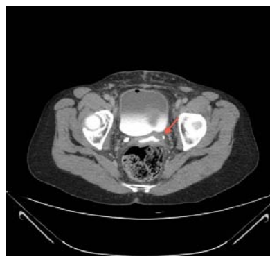
Figure 1: Axial CT-Scan shows contrast extravasations from the left distal ureter and free reflux of contrast material within the vagina (Red Arrow).

Approximately 3 weeks after the procedure, the patient presented to our institution with constant fluid drainage from the vagina. Gynecologic examination revealed the occurrence of a urogenital fistula located in the vaginal vault and the instillation of methylene blue dye into urinary bladder showed no leakage. A CT scan observed unequivocal signs of an approximately 9-mm large communication between the vagina and the distal left ureter (ureterovaginal fistula - UVF) (Figure 1), but no evidence of urinary ectasia or regional liquid