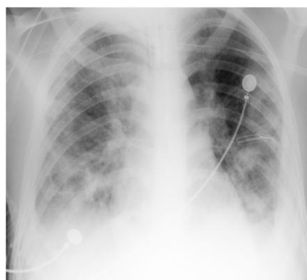
Figure 1: Chest Radiograph Showing Bilateral Lung Nodules.

The cervical abscess was drained immediately, and cultures of the drainage material showed methicilin resistant S. aureus coagulase positive, the resistance was also to erythromycin and ofloxacin. The bacteria were sensitive exclusively to gentamycin, rifampicin and vancomycin. Blood cultures and bronchic material of aspiration revealed the same bacteria. Testing for HIV was negative. Even if the