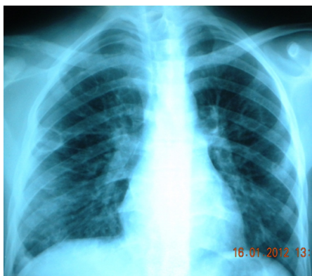
Figure 3: Chest Radiograph shows Residual Pneumatocoles.