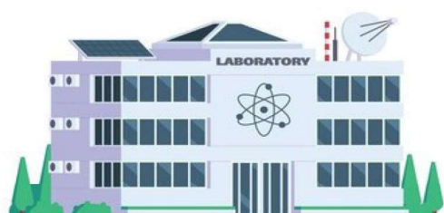
Author's Laboratory/Research centre's Logo