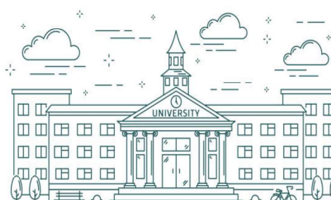
Author's University/Organization's Logo