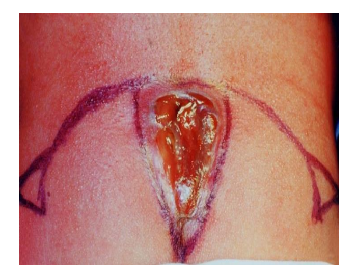
Figure 1: Two rotation flaps, associated with two small compensatory triangles. Incision bordering the neural plate, placed at the interface between the skin and the arachnoid, whose excess will be removed.

Under general endotracheal anesthesia, with the patient in the prone position (with the head of the table moderately depressed to minimize eventual CSF loss at the time of incision of the sac, namely in meningoceles), after cleaning the surrounding skin with active antiseptics (hibitane or iodine, but caring that the neural plate is not touched by this solution), the exposed medulla is simply washed with saline. Surgery starts by developing two large cutaneous flaps based inferiorly and externally (associated with two small compensatory triangles), that will later be rotated to the midline (Figure 1) [2].