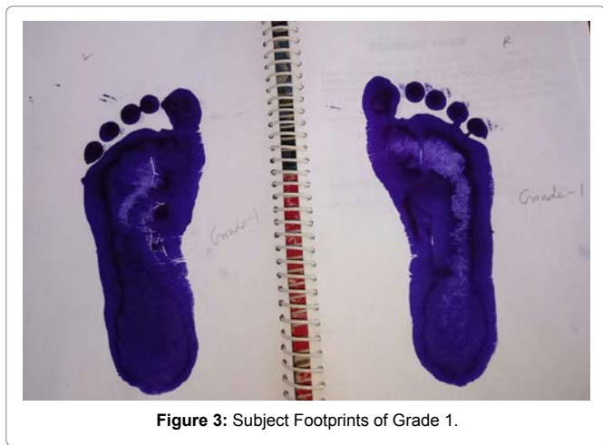
Figure 3: Subject Footprints of Grade 1.