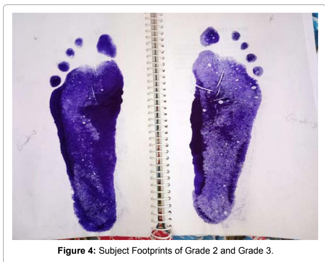
Figure 4: Subject Footprints of Grade 2 and Grade 3.

the weight and flat foot grade. As the BMI increases, the grade level of the flat foot also increases.