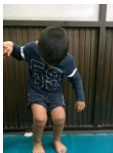
Figure 1: In 2017 knee was flexed in standing.

Range of motion exercise: Firstly PROM exercise-10 repetition was applied to maintain normal Passive movement of knee extension and ankle dorsiflexion. In 2017 reduced active knee extension but there was markedly improvement was found in 2019 (Figures 1 and 2).