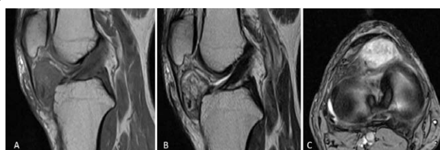
Figure 2: MRI examination of the knee revealed a well-defined extrasosseous mass along the anterolateral aspect of the proximal tibia. The lesion was in contact with the underlying bone without cortical breach or bony discontinuity, but causing displacement of the anterior fat pad without involvement to the patellar tendon. No evidence of joint effusion was present. The adjacent tendons and ligaments were normal with preserved fat planes. The mass was isointense to the muscle on T1W images and hyperintense on T2W images. There were some hypointense foci seen on both T1 and T2 images represent calcification proved on plain radiographs. After Gadolinium administration, the mass showed heterogeneously strong enhancement. MRI confirmed the extrasosseous, extrasynovial location of the lesion.