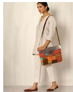
Figure 7: Colorful Laptop Bag.

But now, it has become stylish and funky when paired with a pair of Denims. People make eyewear as a part of their look and flaunt with fast fashion garments. Similarly, belts and scarves has also changed the line of style such as tie and die piece of stole is carried on a solid color base top wearing messy scarf style looks sassy. Patterned belt shapes the extra volume in the garment such as top or dress [15,16]. Usually women and men prefer handbags of different color and style as to stand out in simple dressing as shown in Figure 7 where a woman dressed in a simple formal carrying a colorful laptop bag as a