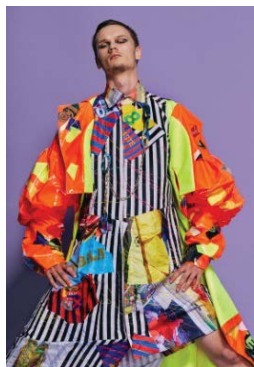
Figure 6: Colourful Recycled Garment.

wheel along with weird contrasting. Garment industry has to choose right colors because poor selection will lead to finish of a brand image. It eliminates the perception of the brand in the minds of people [12]. Taking the demand of mass market as priority; industries are working with right color palette with accuracy in pantone numbers. It is influencing people to think, innovate, like and behave towards the brand. It helps them to decide what is important and growing rapidly.