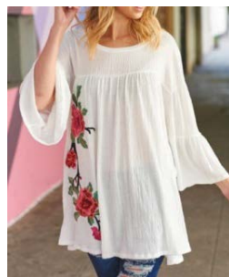
Figure 2: Simpler Floral Patched.

fashion has a good impact in growth of garment industry [6].