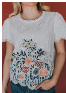
Figure 1: Heavy Embroidered Top.