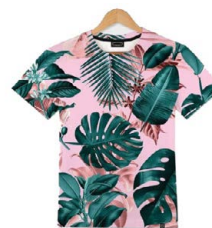
Figure 4: Overall Printed Top.