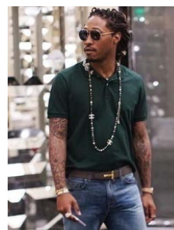
Figure 8: Branded Neck Piece.