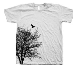
Figure 3: Print Top.

There are many varieties of fabric available within the garment industry; it is the color and pattern in a fabric which is an effective factor in a readymade garment. The type of fabric chosen for a construction of a particular product depends upon the properties such as the way a fabric is felt on skin, or the behavior when sewing it. The