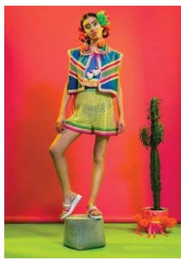
Figure 5: Primary Colours Top.

Unique and pop hues are more pronounced in the present generation, since customers prefer brighter side of the color wheel contrasting with the Pastels. Customers are more inclined towards contrast combos as shown in Figure 5 includes primary colors and in Figure 6 which is a colorful recycled garment combined with stripes in men's fashion. Mass people are majorly into brighter side of color