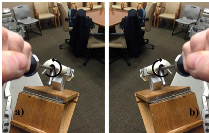
Figure 1: Coronal view of saw bones depicting direction of torque needed to produce anteversion.

with the insertion of the femoral component. This is not the case in right-sided hemiarthroplasties with the same system. Here, one may apply clockwise torque to the inserter which will fully translate to anteversion of the femoral component during insertion (Figure 2).