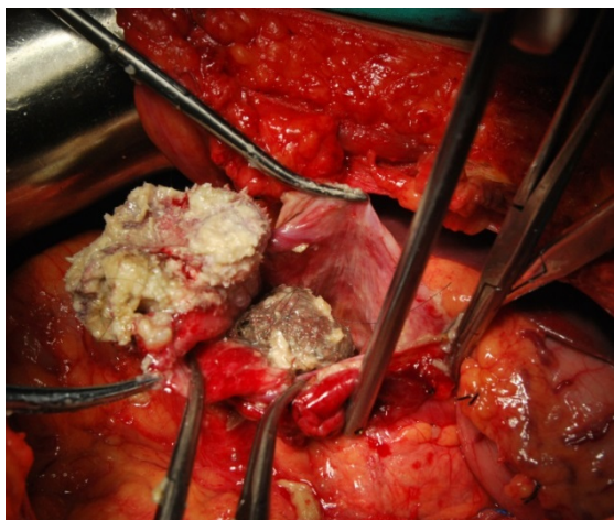
Figure 3: Intraoperative picture.

but operative findings and pathological examination of resected specimen confirm its origin to be from the lesser omentum instead of the pancreas. The origin and characteristic imaging features are critical for differentiating between lesions that need surgical resection and those that require medical treatment or no treatment at all. Symptomatic mature teratomas in the lesser omentum are easily managed and treatment through surgical intervention is usually sufficient.