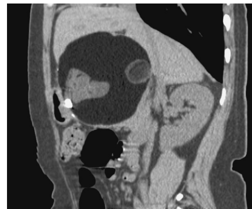
Figure 2: Horizontal abdominal CT scan showed a cystic-solid mass in the lesser omentum.

Principal findings of mature teratomas on CT images are a well-defined mass with separate cystic and solid components of varying proportions, discrete areas with densities similar to that of fat, or coarse, globular calcifications within the solid component. Recognition of these findings may allow the radiologist to make a correct preoperative diagnosis, but often there are diagnostic uncertainties about tracking the organ origin of teratomas due to huge mass. In fact, there are some debates regarding the origin of teratomas in our patient,