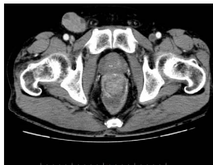
Figure 2: In abdominal CT, a tumor was found in the lower rectum showing a contrast effect, and the right inguinal lymph node had expanded.