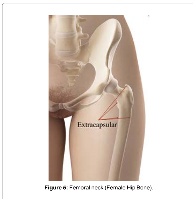
Figure 5: Femoral neck (Female Hip Bone).