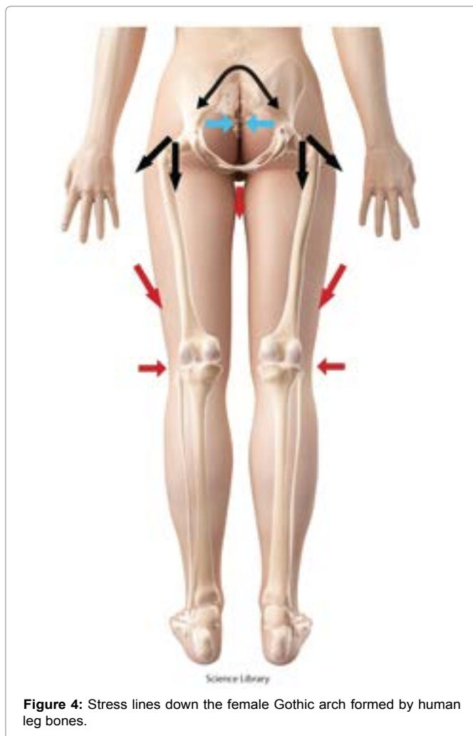
Figure 4: Stress lines down the female Gothic arch formed by human leg bones.

Certainly, the intracapsular and subtrochanteric extracapsular femoral fractures occur exactly where the stress lines are greatest in a female skeletal Gothic arch (intracapsular and subtrochanteric extracapsular locations in Figure 5 and the fracture at the [black] stress lines in Figures 3 and 4). A slight increase in the transverse dimension (pelvic width acetabulum to acetabulum) of the pelvic Gothic arch, results in a significant increase in the lines of force outward portentously contributing to possible intracapsular and