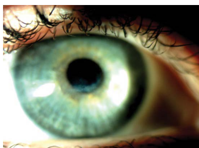
Figure 3: Biomicroscopic appearance of the right eye after 1 year after showing the regeneration of corneal thickness.