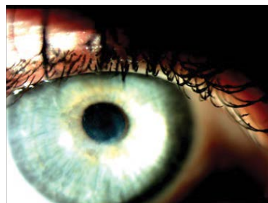
Figure 1: Biomicroscopic appearance of the right eye reflecting a dry oval cone and scarring the ocular surface.

1 Year: The UDVA was 0.1 sc, CDVA was 0.2 cc, slit lamp biomicroscopy show corneal transparency and regeneration of corneal thickness (Figure 3) and the central corneal thickness was 484 \mu m by the first year after operation (Figure 4).