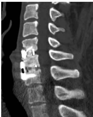
Figure 3: It shows a CT scan of a C5-6 ACDF grafted with Fibergraft BG Morsels at 4-months post-operation. This subject had undergone a previous ACDF at C6-7 without the use of Fibergraft BG Morsels. The fusion with Fibergraft BG Morsels at C5-6 appears to be more complete than the fusion at C6-7.