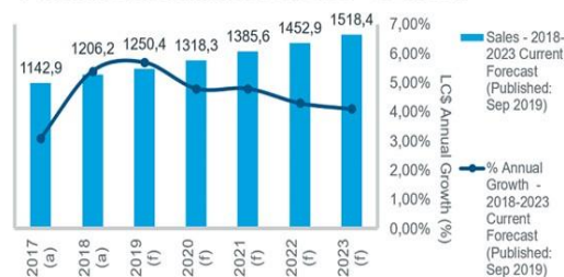
Pharmaceutical Market Forecast - Overview

In directing the investigation, the Bureau depended on openly accessible data, information bought from information suppliers, and data intentionally gave by division members. In July 2007, a fundamental draft of the examination was flowed to key intrigue bunches for certainty checking and to furnish them with a chance to offer extra data.