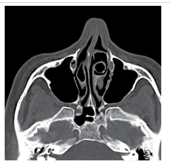
Figure 1: Axial cross-section of the paranasal sinus computed tomography (Double concha bullosa in left middle turbinate) .

All articles published in Journal of Otology & Rhinology are the property of SciTechnol, and is protected by copyright laws. Copyright © 2016, SciTechnol, All Rights Reserved.