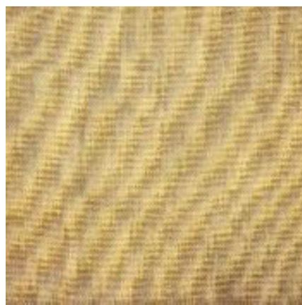
Figure 2: Dyed fabric sample with 0.5% nanomaterials.

nanoparticles, especially silver nanoparticles, are cheap, stable and effective in comparison to the organic antibacterial materials. Silver ions have antimicrobial and photoactive properties, and textile products treated with old silver nanoparticles are in limited colors. Consumers want textile products with enhanced functions, such as antibacterial, antistatic, dye resistance and light-ray protection [7-9].