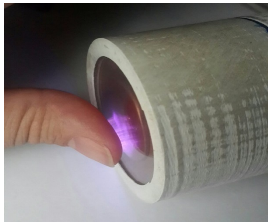
Figure 1: Appearance of the discharge.

Electrodes of several sizes are developed, from 50 mm in diameter to 5 mm. The glass of 1 mm thickness is used as the dielectric. The discharge gap between glass and the sample was fixed at 2-3 mm. The electrode was moved around the surface of the liver. Discharge power density was 2 W/cm 2 . The temperature of the plasma was about 40°C.