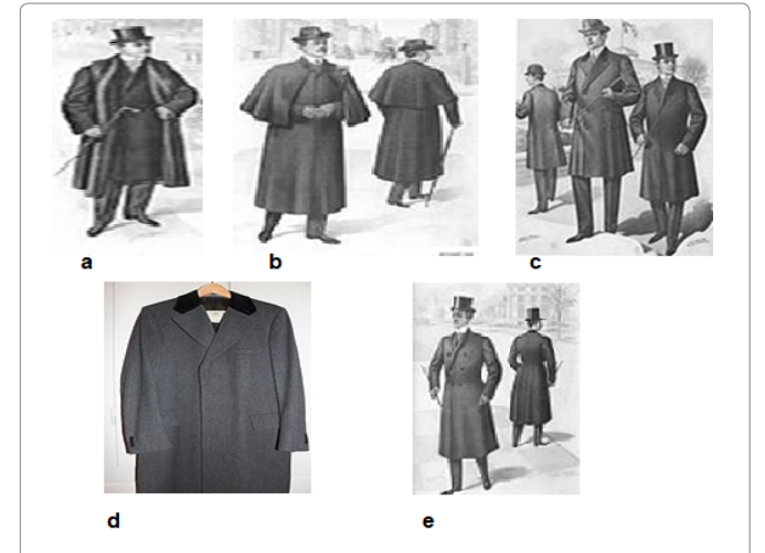
Figure 1: Greatcoat (a), Ulster coat (b), Chesterfield coat (c), Covert coat (d), Frock coat (e).

One of the animals that always wear a coat is the hedgehog. Hedgehogs are mammals that belong to the family of hedgehogs (Scientific name: Erinaceidae). Hedgehogs often bullet themselves when they feel threatened, with all of their blades facing out. All species of hedgehogs benefit from this defense mechanism, but their success depends on the size of their blades. For this reason, species of hedgehogs that weigh less than razor blades are more likely to run away from the enemy and sometimes attack him, using their razor blades as a last resort. One of the unusual features of hedgehogs is the connection of the lower part of the lower and upper extremity bones.