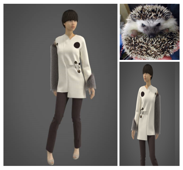
Figure 6: Fifth overcoat designing.