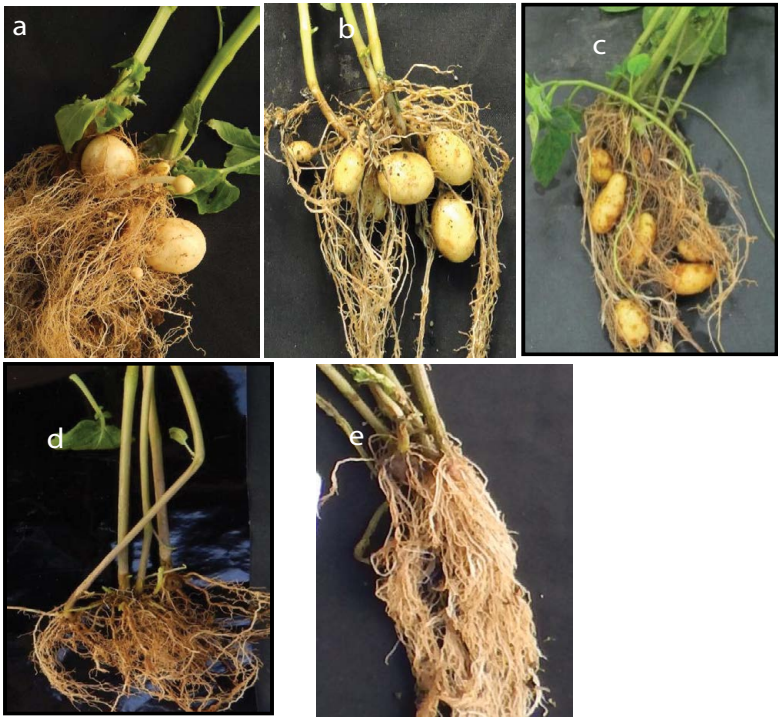
Figure 1: Tuber formation in potted plants 21 d after heat stress at 24°C in controlled environment chambers. (a) CP 4054 (b) CP 4398 (c) Kufri Surya (d) Kufri Chandramukhi (e) Kufri Himalini. Well sprouted tubers of similar size were planted in potting mixture in 15 cm pots with five replications per cultivar for each experiment. Plants were grown under non tuberizing conditions at 24°C under continuous light (600 \mu\text{Es}^{-1}\text{m}^{-2} ) in a controlled environment chamber (Conviro, Model E-15, Canada). After 30 days, the plants were subjected to heat stress treatment of (24 /24 °C) with 12 h photoperiod. Tuber formation was observed 21 days after stress.