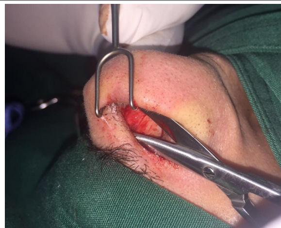
Figure 1: At the site of the hemitransfixion incision the skin margin is grasped and everted by Allison's forceps with the finger guarding the opposite side, blunt pointed scissors are used to create a groove all through the height of the columella