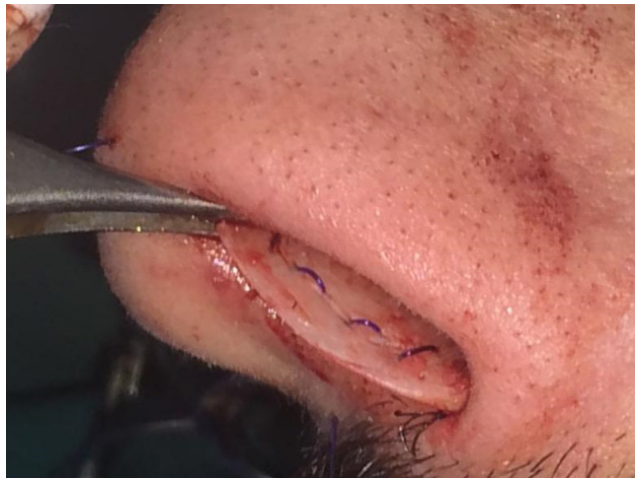
Figure 3: The suture is then applied to the caudal end of the septal cartilage two millimeters proximal to the edge in a zigzag fashion till the dome of the nasal tip