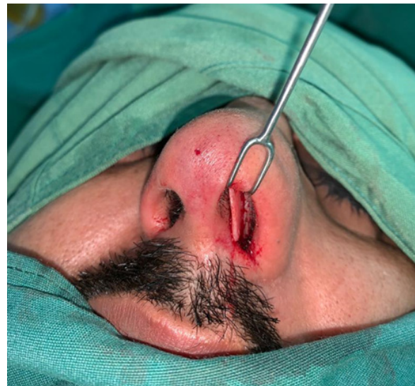
Figure 1: Rolled caudal end of the septal cartilage should be released, stretched beside the columella and trimmed flush with the anterior border of the columellar skin

The hemitransfixion incision is sutured using inverted simple absorbable 3/0 suture. Non absorbable 4/0 stay suture is used to narrow the base of the columella and/or medial crurae if found to be wide after the TIG technique.