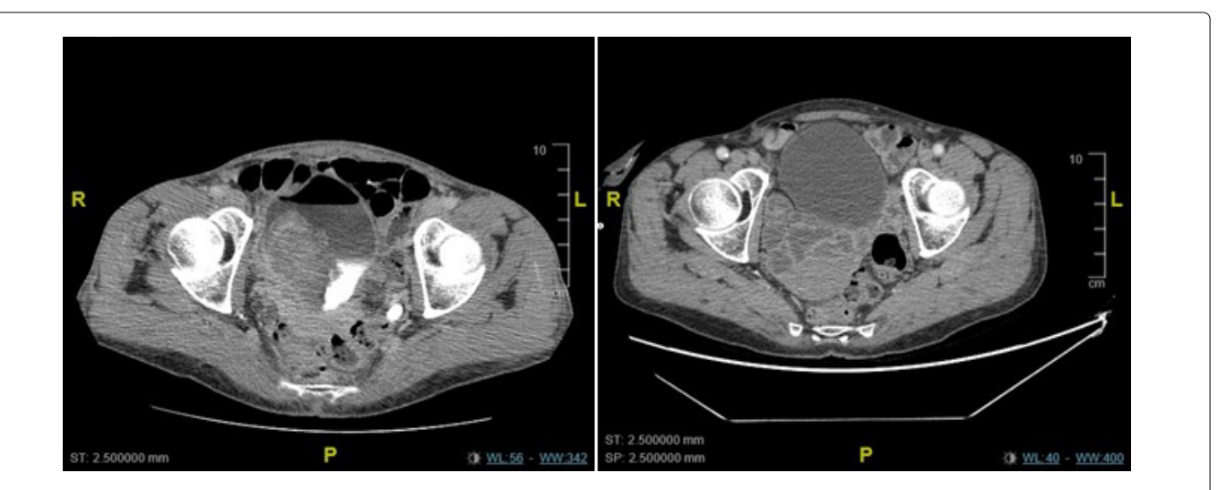
Figure 3: Resolution of 7.5 cm right lateral bladder mass (left image) after treatment with TURBT, Accelerated Methotrexate, Vinblastine, Doxorubicin, and Cisplatin (AMVAC), and concurrent FBZ 1 gm three times weekly (right image).