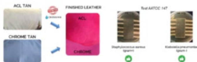
Figure 1. Examples of ACL tanned leather and antimicrobial packaging

Our research Team is actively engaged in the development of a new class of green chemical compounds which may be used to improve environmental sustainability of a variety of products/processes designed with a circular economy approach. We will report the use of a new class of active cross-linking agents (ACL) which can be employed to produce non-toxic metal free leather, antifouling paints, active packaging. The great potential of ACL is embedded in their multiple applications. These activators can link together different molecules or functional groups with a "lock and key" mechanism, similarly to enzymes or catalysts so that no trace of the ACL is left in the final product after reaction. Few examples of the importance of this outstanding feature will be given concerning leather manufacturing and antimicrobial packaging production. As far as leather production is concerned, the fundamental and unprecedented difference between conventional tanning agents and ACL is that the latter act as "catalysts" and are not retained in leather after tanning. They stabilize the collagen structure, allowing to produce high quality tanned leather which is devoid chemicals and is thus non-toxic (Figure 1). Main environmental benefits derive from the absence of chrome slurries, reduction in chemical consumption and hazard.