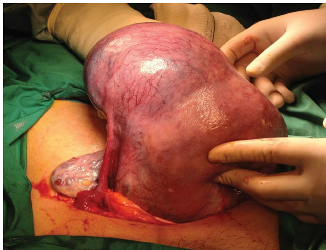
Figure 1: Right cornual mass containing the adherent placenta.