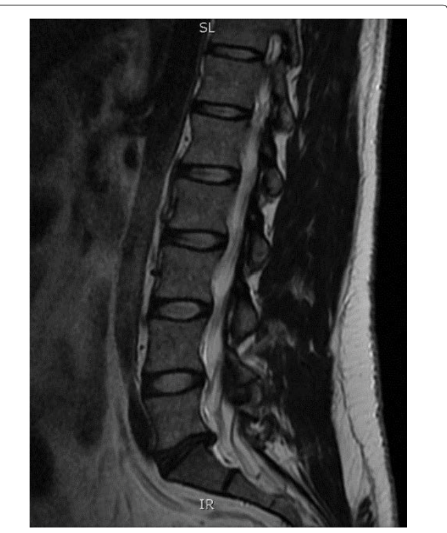
Figure 1: T2 weighted sagittal lumbar MRI demonstrating disc bulge and facet disease at L5-S1.

Follow-up visits were performed at 6 weeks and 3 months after the injections, at which time Oswestry Disability Index (ODI) and 0-10 Numerical Rating Scale (NRS) "current" and "worst pain" scores