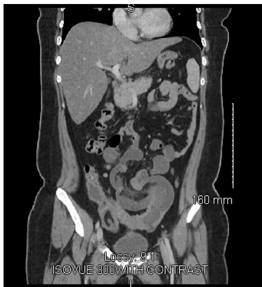
Figure 2B: Coronal computed tomography cut of the abdomen and pelvis with intravenous contrast.

removed and the incision was clean, dry, and intact. At six weeks follow up, the patient was back to her normal activities.