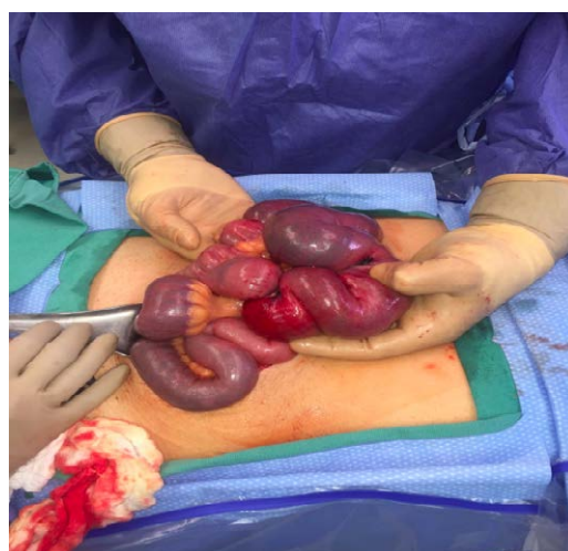
Figure 3A: Intraoperative photograph of dilated and edematous distal ileum demonstrating loops of very friable small bowel approximately 2 feet from ileocecal valve. This region of small bowel appeared to be very injected and ischemic.

a maximal diameter of 4 cm. The Intussusception site was grossly identified and the starting point was about 5.5 cm from one resection margin. A bloody Meckel's diverticulum was identified inside of the resected small bowel, which measured 31 cm in length with diameters ranging from 1.5-2.5 cm. The distal tip of the telescoping Meckel's diverticulum had a blind end, with an infarcted mass measuring 3.3 cm in length and a maximal diameter of 1.5 cm. The microscopic pathological examination of sections through the telescoping Meckel's diverticulum showed extensive hemorrhagic infarction. Sections through the mass lesion at the lead point of intussusception showed a lipomatous lesion with hemorrhagic infarction. Scattered benign glands were present, consistent with heterotopic gastric tissue. There was no evidence of malignancy.