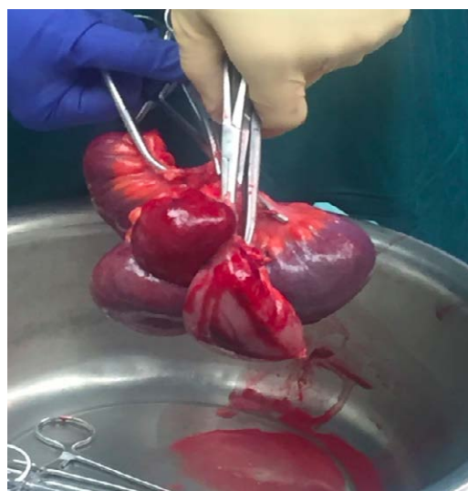
Figure 3B: Intraoperative photograph of resected segment of ileum. The specimen consisted of a resected rigid small bowel segment, measuring 40 cm in length, with a maximal diameter of 4 cm. Intussusception site is grossly identified and the starting point was about 5.5 cm from one resection margin