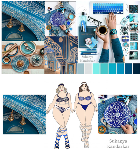
Figure 3: Neela Darbar Collection.

collection is put up in the best possible way to create and hit the ancients of Jaipur beautifully (Figure 3).