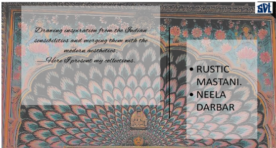
Figure 1: My Collection.

Introducing the second collection its blue shades and the touch of jaipur art over crockery mandala is been traced by me. The inspiration of this collection is an art of ancients with its own geometric beauty to stand out to ones vision. The collection represents Plus size model everyone deserves to feel beautiful and sexy in their own body, and lingerie that fits well is what everyone needs. The Neela Darbar