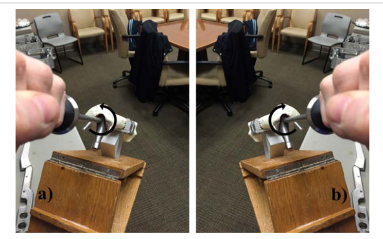
Figure 1: Coronal view of saw bones depicting direction of torque needed to produce anteversion. a) Counterclockwise torque needed for anteversion in LEFT hip hemiarthroplasty. b) Clockwise torque needed for anteversion in RIGHT hip hemiarthroplasty.

with the insertion of the femoral component. This is not the case in right-sided hemiarthroplasties with the same system. Here, one may apply clockwise torque to the inserter which will fully translate to anteversion of the femoral component during insertion (Figure 2).