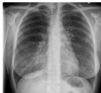
Figure 1: Plain chest X ray.

This 44 year old retired air stewardess developed rapidly progressive renal failure secondary to IgA nephropathy in 2005, and underwent a successful deceased donor renal transplant in 2006. She has no other past medical history, and was immunosuppressed on single agent of tacrolimus. She remained fit and well until late 2014, when she presented to her primary care physician with a six week history of a dry cough and progressive shortness of breath. She was uncomplaining of other symptoms. Her symptoms were initially treated as a lower respiratory tract infection with co-trimazole and later doxycycline, but this failed to improve her condition. Her inflammatory markers remained within the normal parameters (CRP<5 mg/dl) but a plain radiograph of her chest (Figure 2) revealed bilateral interstitial infiltrates.