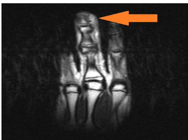
Figure 2: Lateral MRI scan showing extensive soft tissue edema and swelling and osteomyelitis of the distal phalanx.

in the evaluation of deep soft tissue infection of the finger. In our case, empiric treatment with Ampicillin-Sulbactam and Clindamycin achieved prompt clinical resolution of the infection.