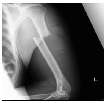
Figure 2: 52-year-old man who sustained fracture of the left upper arm. X-ray showing fracture of the left humerus.

Volcanic eruptions can cause various forms of disaster, where volcaniclastic materials such as lava, volcanic rocks, and ash are generated to cause unique forms of damage. Moreover, because these damaging factors are not generated at the same time, the type