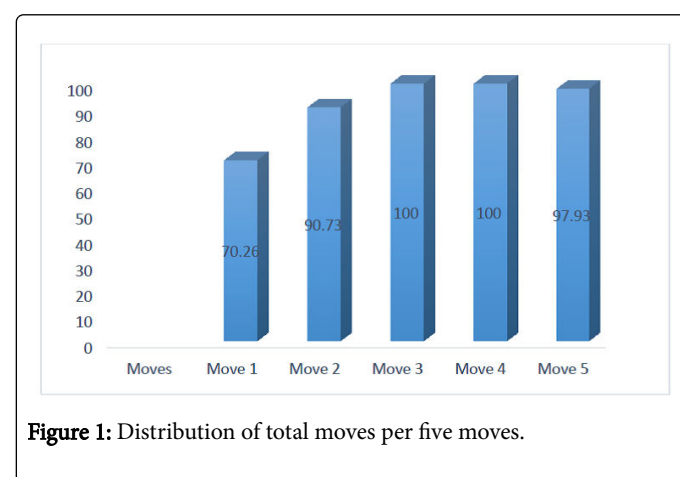
Figure 1: Distribution of total moves per five moves.

As Table 2 shows, all of the abstracts in medical sciences had five moves. A closer look at schematic analysis of abstracts in medical sciences revealed that almost all the abstracts contained the Situating The Research (STR) move, Presenting The Research (PTR) move, Describing The Methodology (DTM) move, Summarizing The Results (STR) move, and Discussing The Research (DTR) move. These parts are considered the main components of research articles which are usually required from academic writers in most of scholarly journals and international congresses [16]. For more detailed distribution of the five moves and steps in medical abstracts Figure 1.