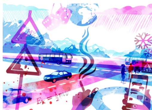
Figure 1: Common risk factors for crashes.

In 2008, a staff survey on road safety was conducted and covered travel in the years 2005-2007 [7]. The purpose of the survey was to analyze road safety problems faced by travelers, identify high-risk countries, and suggest strategies for prevention [7].