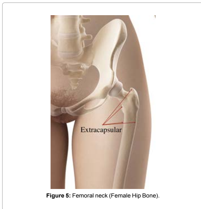
Figure 5: Femoral neck (Female Hip Bone).