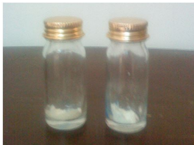
Plate 2: The dry test tube showing the new developed antibiotic residue detection method (D-SAFT1).

Preparation of the test mixture: For each test tube; powder milk (0.5 gram) lactose (0.02 gram), bromocresol green indicator solution (0.5 ml) and 0.1 ml of 1.5 \times 10^7 Lactobacillus casei MRS culture were added to each test tube containing specific amount of antibiotic standard. The color changes from white to blue. The pH measurements were recorded for each concentration at one hour intervals during three hours. If there was no change in the milk color this indicates negative result (Plate 2 and 3).