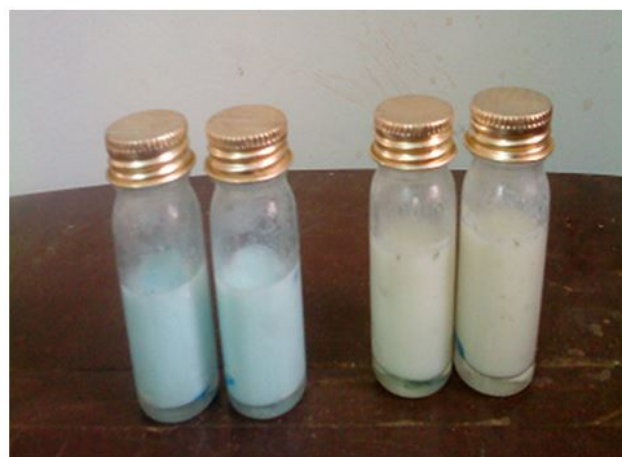
Plate 3: Positive and negative results for D-SAFT1 antibiotic residue detection method.

Designing of the final form of the test: Universal bottles (n=300) containing powder milk (0.5 gram) and 0.02 gram of lactose, 2 drops of bromocresol green indicator and 0.1 ml of 1.5 \times 10^7 Lactobacillus casei MRS culture were frozen in a deep freezer at -200°C for 24 hours. Then the mixture in the bottles was lyophilized using cold drying apparatus at -600°C. After that the test was ready for use and can be kept at room temperature however, cold and dry place is preferred.