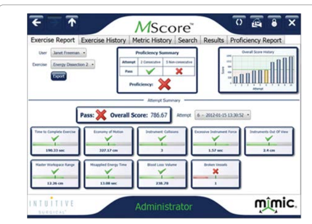
Figure 8: A virtual reality simulator proficiency-based performance report.