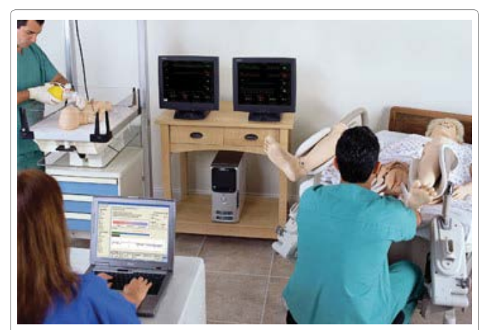
Figure 1: Noelle S575. Reproduced with permission from Gaumard Scientific.

Seventeenth century obstetric phantom simulators gave way to Madame du Coudray's, King Louis XV of Frances' midwife's instructional full-size bone, leather, and wicker mannequins, the Machine shown in Figure 3 [6]. Modern medical simulators evolved from Link trainer flight simulators, hand skill training tools, plastics, digital (instead of analog) computing, and the sequela of the Three Mile Island nuclear power plant accident in 1979 [2,5,7]. In the 1990's Eggert, Eggert, and Vallejo made Noelle, an electronic mannequin shown in Figure 1 [5]. Human cadaver imaging, completed in 1994 by the National Library of Medicine's