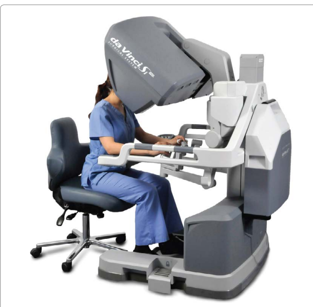
Figure 5: da Vinci skills simulator attached to da Vinci surgical Si console.