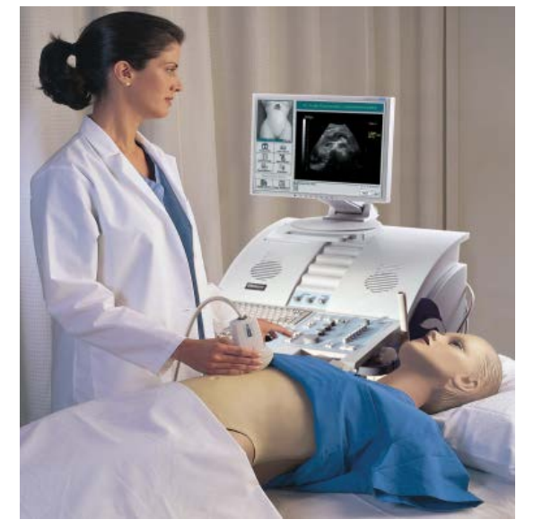
Figure 7: MedSim Inc Ultrasim UST 100® simulator with a full-torso mannequin mock 3.5 MHz curved transducer and Abdomen Module 1 Clinical Case.

A single-blind, prospective, RCT of second trimester fetal anatomy simulation-based versus patient-based ultrasound training with 18 trainees, found similar pretest to posttest improvement p<0.04 and p<0.05, respectively [76]. Ultrasim VRS obstetric ultrasound for fetal biometry (gestational age calculation) achieved construct validity (p<0.001 on initial scan)