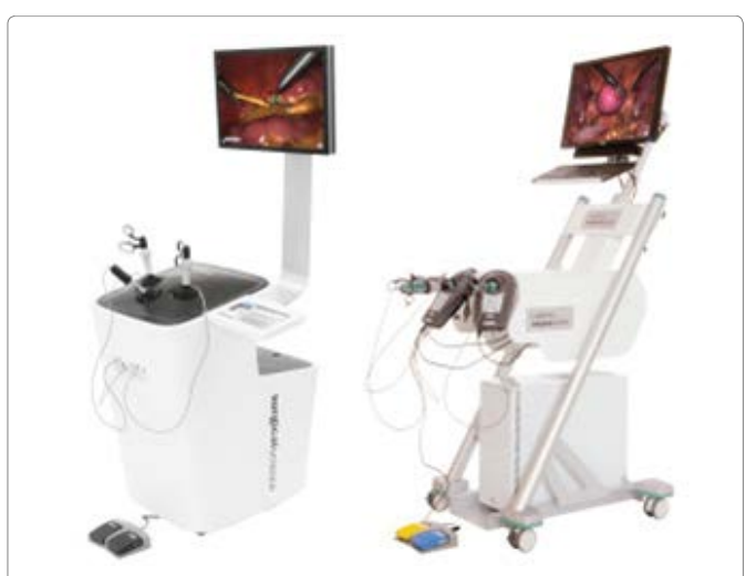
Figure 2: LapSim virtual reality laparoscopic simulator. Haptic and non-haptic versions.