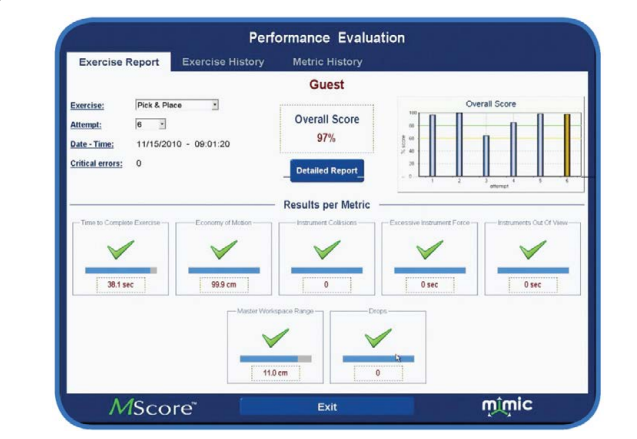
Figure 9: A virtual reality simulator classic scoring performance report.

mannequin ultrasound simulation increases quality of care [75].