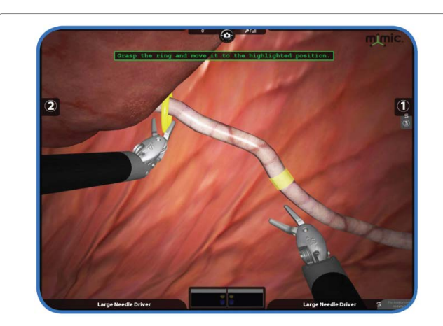
Figure 6: Sample da Vinci skills simulator screen image.

sample of 13 PGY-3 and PGY-4 ObGyn residents and urogynecology fellows, and 20 practicing gynecologic laparoscopists as experts [32]. GOALS scale for depth perception, bimanual dexterity, efficiency, and tissue handling was used. Construct validity was achieved as experts were differentiated from trainees, p=0.001 [32]. Face validity was achieved with 85% of participants finding the simulator realistic and useful for technique improvement [32].