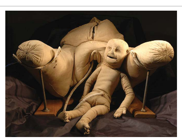
Figure 3: Madame du Coudray's the Machine obstetrical simulator.

Visible Human Project, subsequently facilitated 3-dimensional virtual reality human anatomy manipulation [6]. Virtual reality simulation (VRS), initiated in Morton Heilig's Sensorama in 1956, evolved to the avatar using Second Life internet-based virtual world, which began hosting medical simulations in 2007 as Ann Myers Medical Center [6].