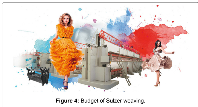
Figure 4: Budget of Sulzer weaving.