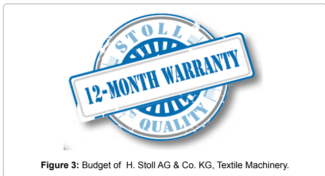
Figure 3: Budget of H. Stoll AG & Co. KG, Textile Machinery.