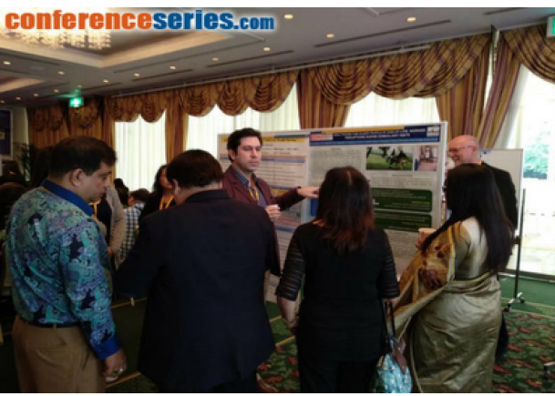
We soulfully <u>welcome</u> you to Japan and hoping that Nursing 2020 will inspire you and will result in new collaborations and friendships!