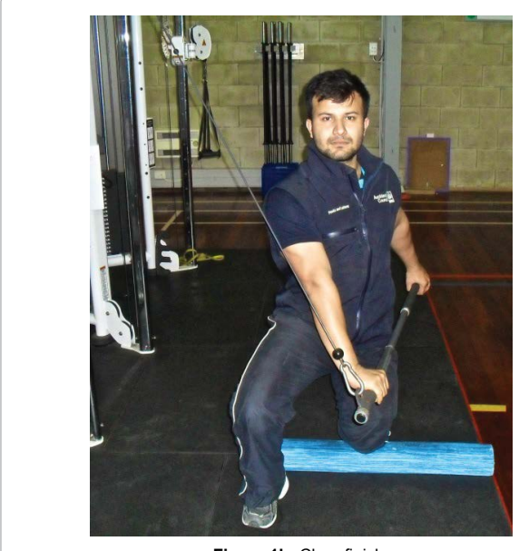
Figure 1b: Chop finish.