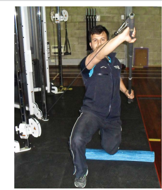
Figure 1d: Lift end.

mean=288W). The mean power output of the left side was 2.7% greater for the chop and 6.3% greater for the lift. The percent change in mean from the right-left chop assessment was between -0.2 to -11.4 W over the three testing occasions (Table 1), denoting a decrease in power output over time. The CVs ranged from 9.2% to 19% and ICCs 0.54 to 0.83 between testing occasions. There were no systematic trends observed in the data.