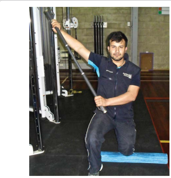
Figure 1a: Chop Start.

Mean peak power outputs for the chop (range=409-494W; mean=450W) were 36% greater than the lift (range=277-314W;