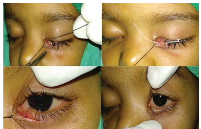
Figure 2: Intraoperative photograph showing surgical wound exposure for the identification of medial lacerated end of the lower canaliculus (top left), followed by placement of monocanalicular stent from lower punctum (top right) through medial cut end of the lower canaliculus (bottom left). Final clinical picture after placement of the stent and pericanalicular repair (bottom right).