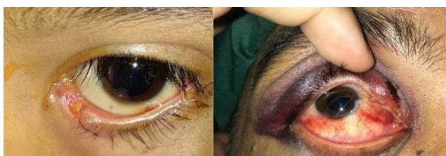
Figure 1: Clinical photographs showing lower canalicular laceration (left) and upper canalicular laceration (right).