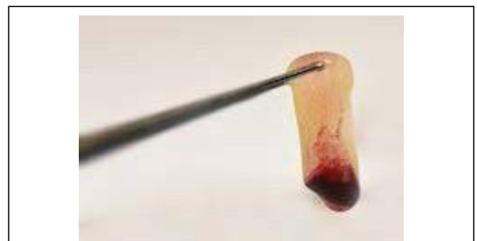
Figure2: The PRF clot can be removed from the tube with surgical tweezers.