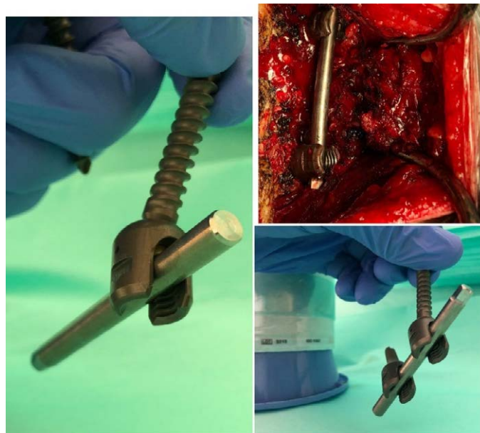
Figure 1: A New system in vivo